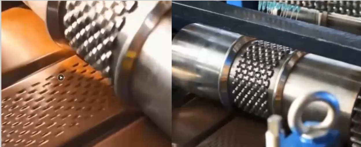
ADJUSTABLE PERFERATION DYES. FOR CENTER, FULL, OR NO VENT SOFFIT PROFILES